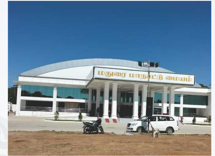
THAMUKKAM CONVENTION CENTRE MADURAI